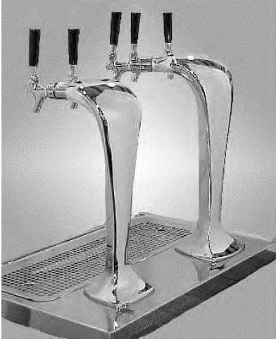
838-23X & 838-33X Mounted on a 1446